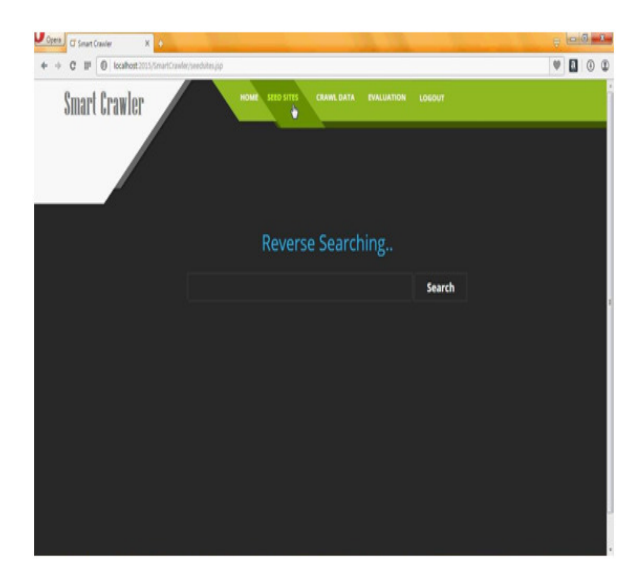
Fig 3: Seed sited