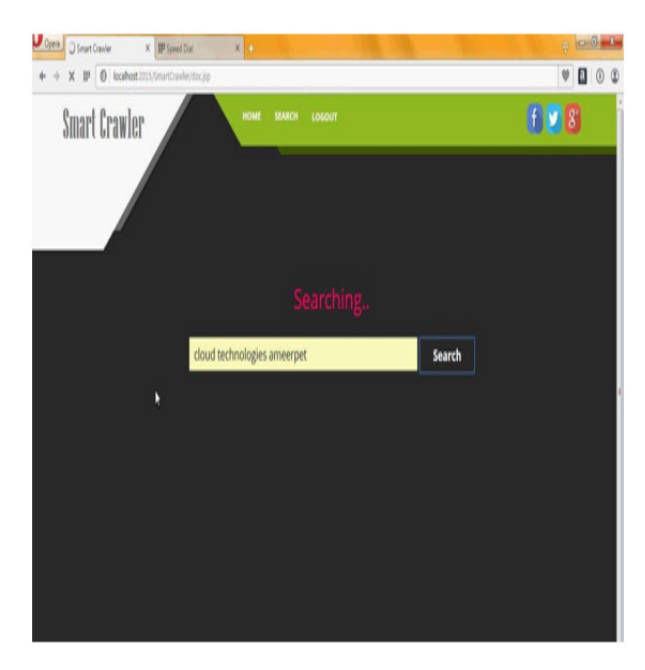
Fig: 1 User search