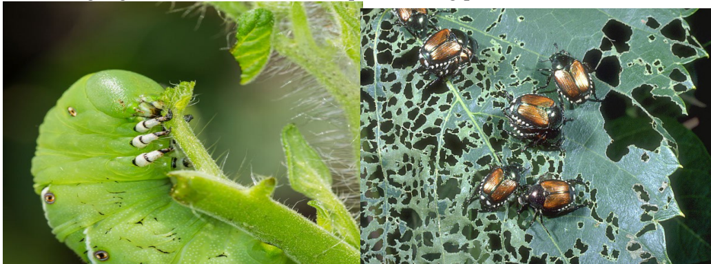
Figure-2: Tomato plants being infested by Figure-3: Japanese beetle

Figures 2-5 highlight some of the insects and pests causing plant diseases.