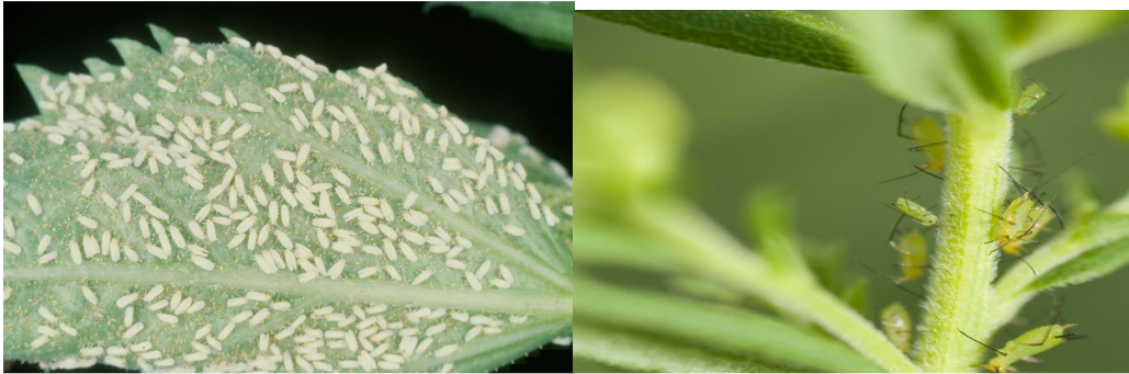
Figure-4: Whitefly infestations Figure-5: Aphids

Capturing the diseases leaf or pest infected leaf will help us identify the underlying cause. Immediately after the capturing the image it is processed and the results and solutions will be shown to the user.